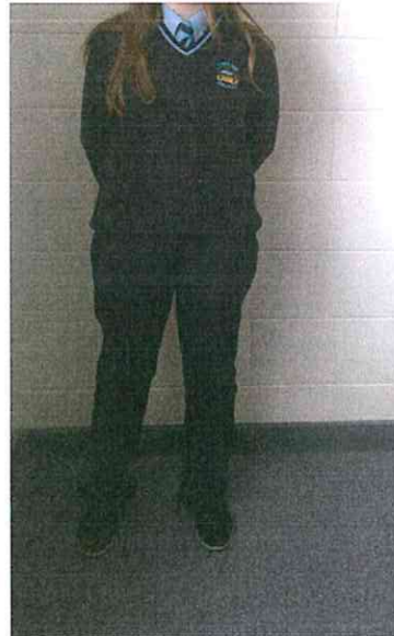
Uniform: (Items are samples with the Comeragh College